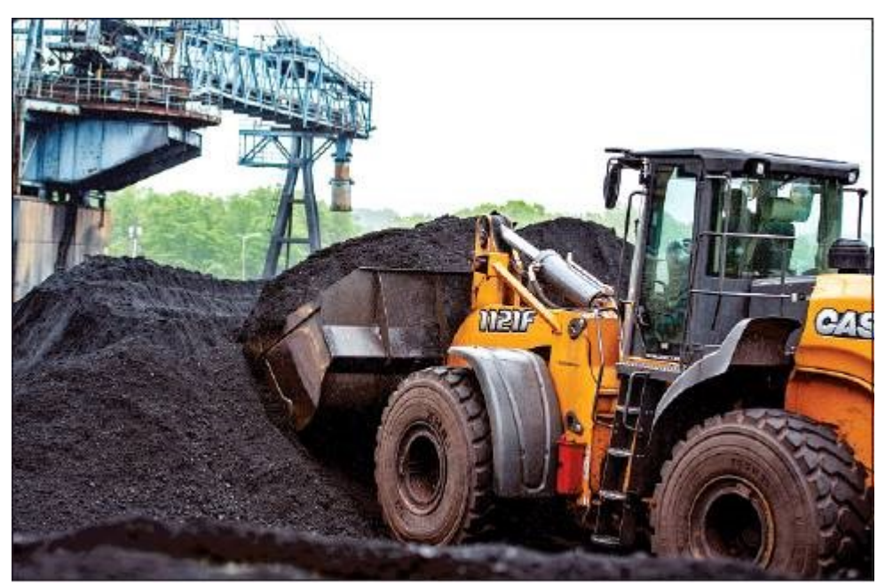
PSEG's coal-fired plaint in Hamilton Township will close on June 1.

Six years after expensive upgrades, the utility will shut down its last two coal-fired power plants in New Jersey, thanks in part to cheap natural gas.